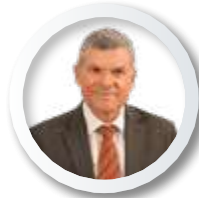
George Papanastasiou Minister for Energy, Commerce & Industry Republic of Cyprus