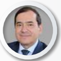
H.E Tarek El Molla Founder and President of Luminant Energy Consultancy Former Minister of Petroleum and Mineral Resources - Egypt