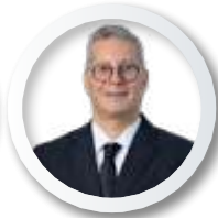
Karim Badawi Minister of Petroleum & Mineral Resources Egypt