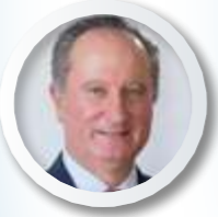
Stavros Malas President The Cyprus Institute